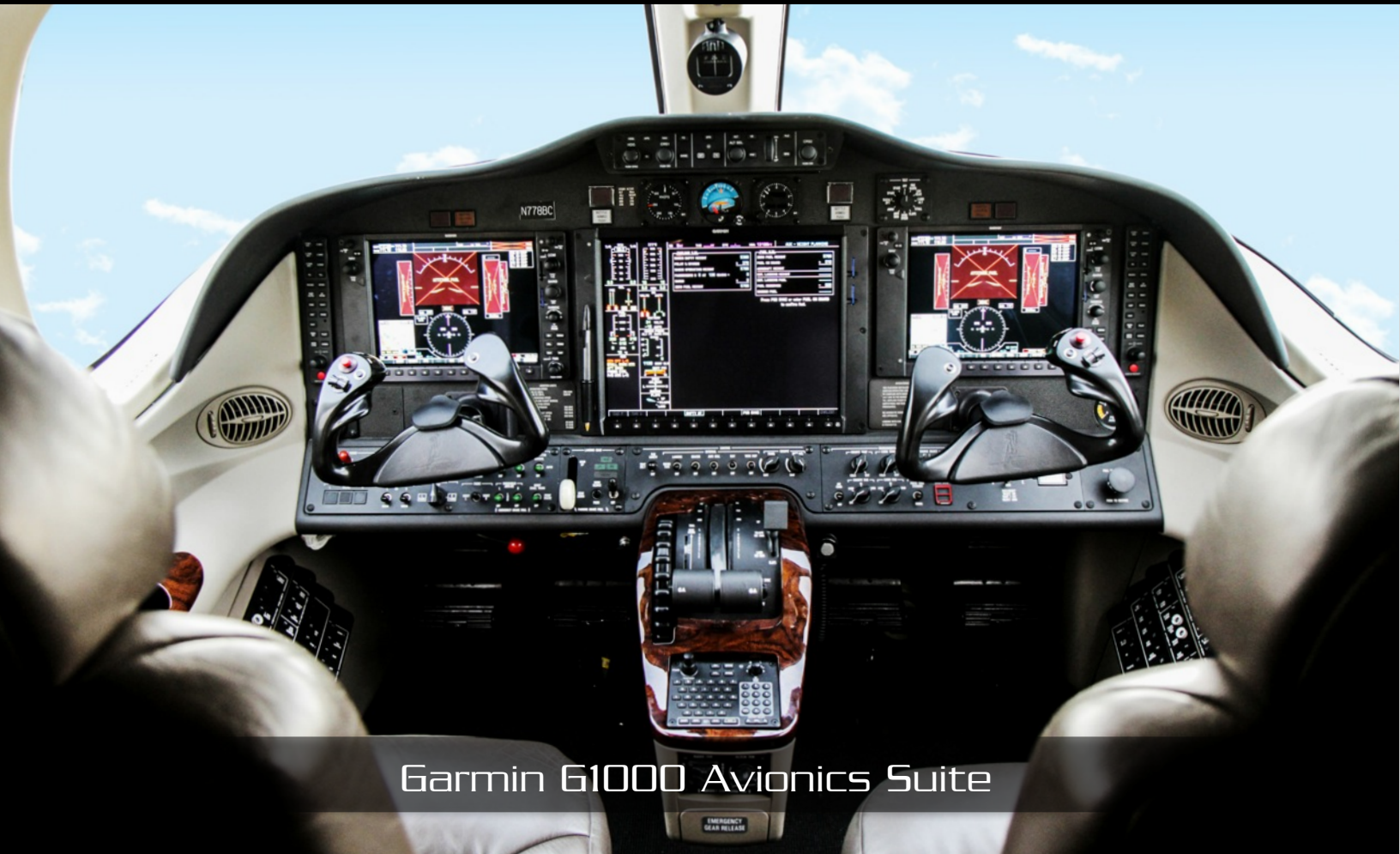
Garmin G1000 Avionics Suite